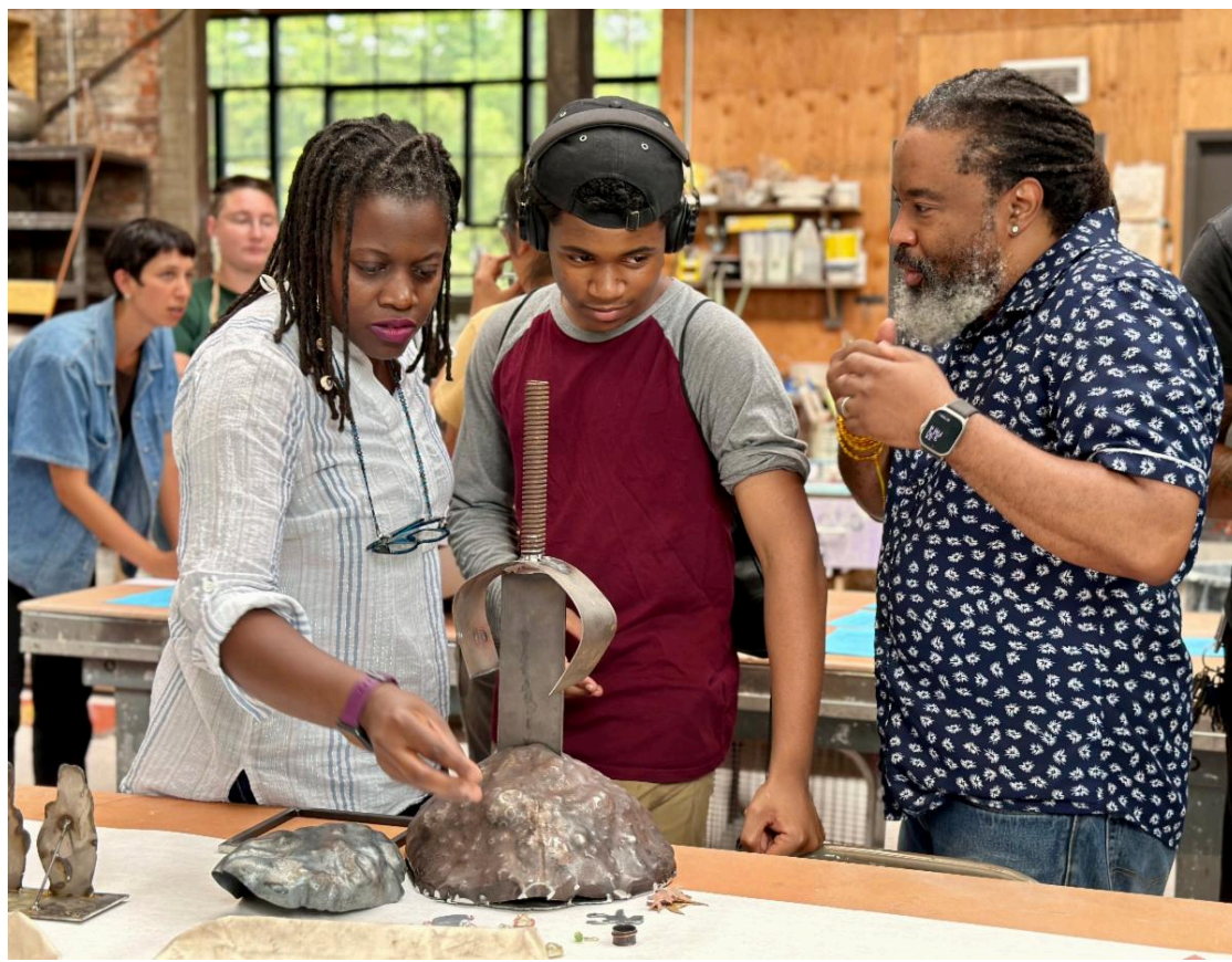
Steel Yard images provided by The Steel Yard

The Steel Yard's unique Workforce Program is working to break barriers by addressing the education and training needs of those living in Rhode Island's communities with the most need. This program provides the technical skills necessary to make participants more employable in livable-wage jobs in manufacturing and the industrial arts. Participants are paid for their on-the-job education and are taught to value their creativity and voice along with their labor contributions.