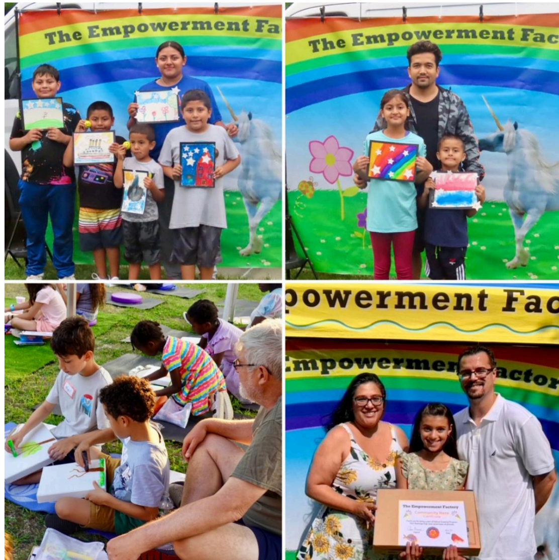
Photo collage below: children with their parents show pride in their creativity.