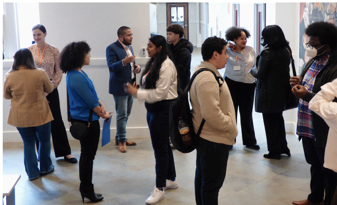
Picture above: Students gather at College Visions for a recent workshop

For two decades, College Visions (CV) has worked tirelessly to break down barriers and create a successful route to higher education for first-generation college students in Rhode Island. CV’s free program includes 1-on-1 advising, resources, guidance, and offers support to students from the admission process through college graduation.