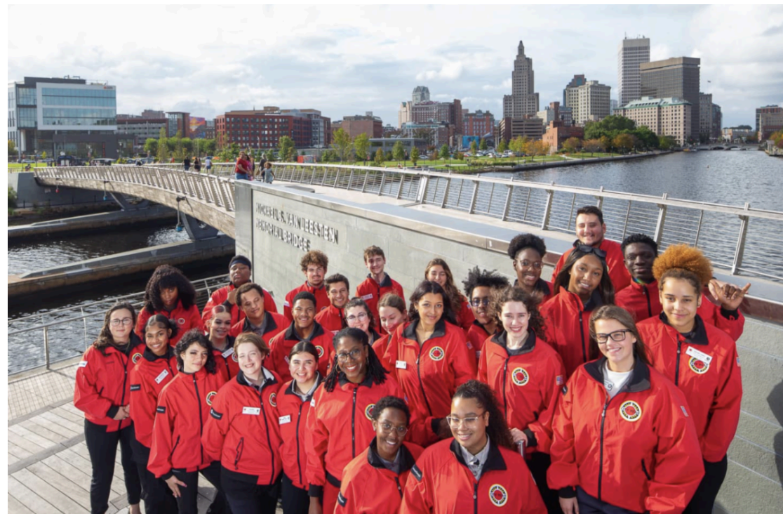
Pictured above: City Year Coaches Gather in Providence, RI

On the third Monday in January, our nation comes together to celebrate and honor Reverend Dr. Martin Luther King, Jr. —a visionary leader who devoted his life to the struggle for justice and equality. Dr. King's powerful message of love, peace, and nonviolence inspired a generation to act and change the course of U.S. history.