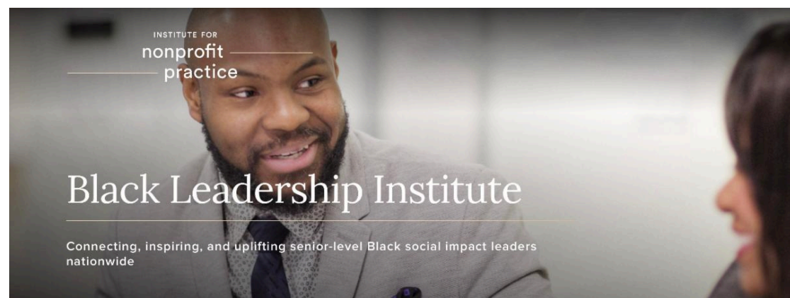
Pictured above: Black Leadership Institute

Dr. King's vision is also realized in the successful outcomes behind the Institute For Nonprofit Practice's (INP) launch of the Black Leadership Institute (BLI) —an initiative that “inspires, and uplifts senior-level Black leaders shaping social impact across the country.”